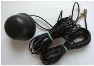
Roof mount antenna GSM/GPS with FME female (GSM) and SMA male (GPS) Part-No 12012